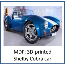
MDF: 3D-printed Shelby Cobra car

Manufacturing Demonstration Facility (MDF) helps industry adopt new manufacturing technologies to reduce life-cycle energy and greenhouse gas emissions, lower production costs and create opportunities for high-paying jobs. http://web.ornl.gov/sci/manufacturing/mdf/